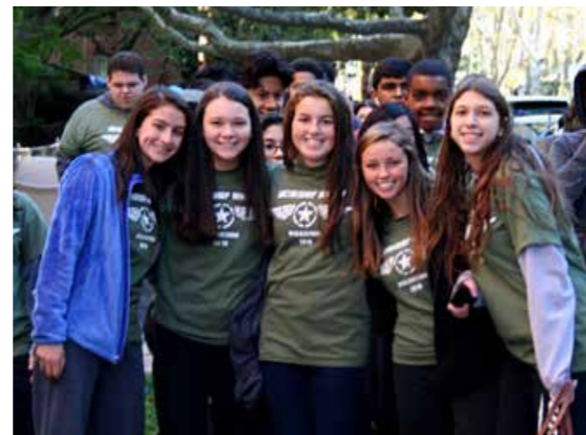
Pictured: Students raise money while participating in the 23rd annual Walkathon.