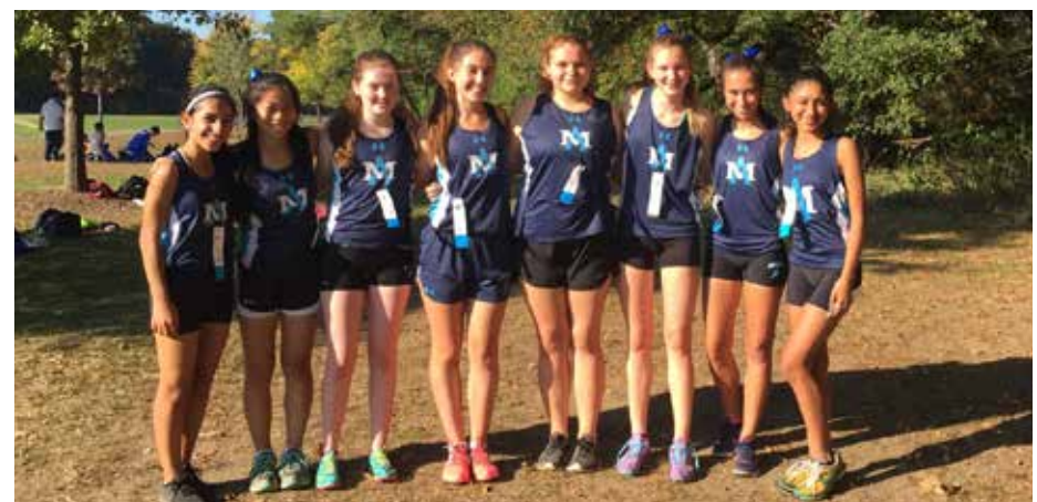
Pictured above: Sophomore girls' track.