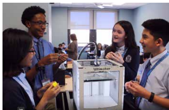
Freshmen use Molloy's new 3D printer.

Over the years technology has changed and improved our lives. With the use of technology we can search for any information on the Internet, we can call people across the world, and it has made most peoples' lives more convenient. Now a new piece