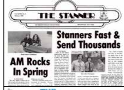
1980 edition of The Stanner