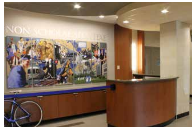
Pictured below: The newly renovated lobby.