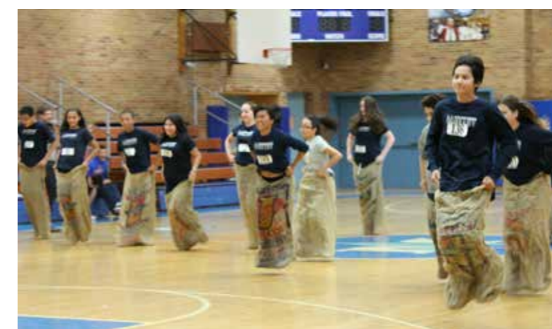
Potato sack race.