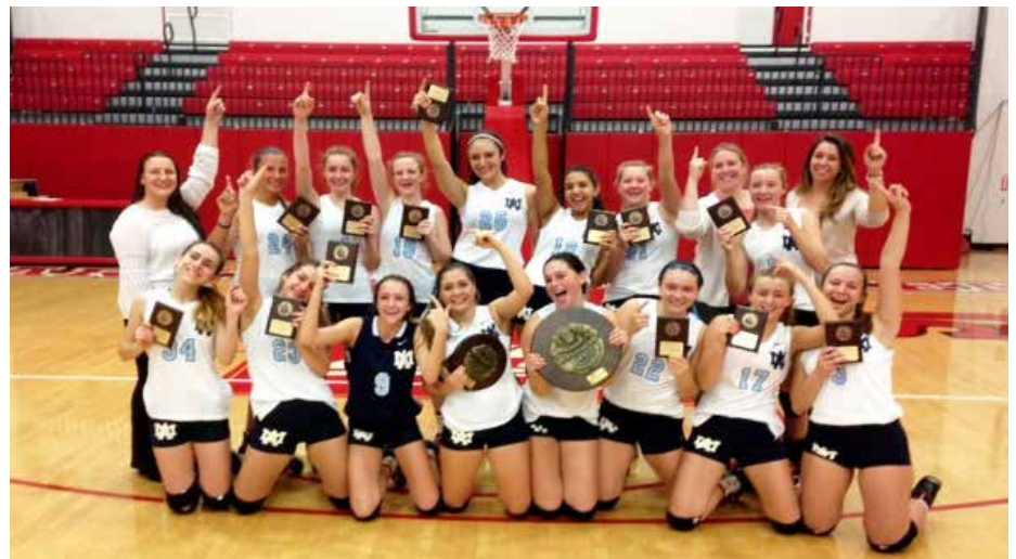
Pictured above: Girls' JV volleyball team.