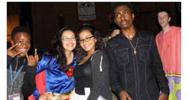
Stanners pose for a photo while enjoying the dance!