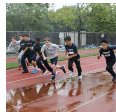
Stanners run relays in the rain.