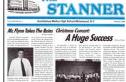
2000 edition of The Stanner