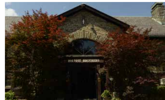
Main Entrance to the Marist Brothers Retreat House.

On Friday, October 7th, the Freshman class went on their first retreat to Esopus. The theme of the retreat was accepting yourself and realizing what you have that makes you special. Although this is the first time freshmen have gone to Esopus while attending Molloy, this isn't their first time visiting Esopus, as some freshmen had the chance to go over the summer during the annual Molloy Freshman Camp. The retreat, which ended on Sunday, October 9th, happened to fall on Columbus Day weekend, which gave freshmen a chance to catch up on extra homework and studying they were unable to do over the weekend. The students departed on the buses right after school ended, at about 2:30pm. The ride, about two and a half hours, was long. When the students arrived at Esopus, they had some fun in the gym and rec room while things were being set up. The students were then brought up to their dorm rooms. After that, they had to give their phones up. The students then were sorted into groups of about 6 or 7 each with their own upperclassman leader. After that the frosh ate dinner and then played some games in the gym, and then had some more free time in the rec room, then placed some games in the gym. Students