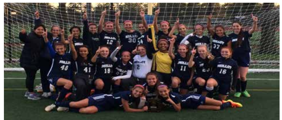
Pictured above: Girls JV soccer team.