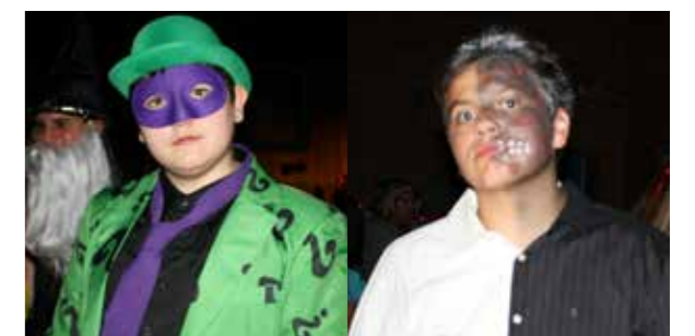
Where’s Batman when you need him?