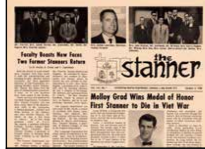
1968 edition of The Stanner