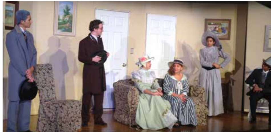
From Pygmalion on November 20th.

Overall, this production provided multiple moments filled with charm and humor. This play, being my first experience attending a Stanner production, took me by surprise at the amount of engaging material and expertise shown throughout every act. I encourage all to attend the spring production: The Pajama Game by Richard Bissell and George Abbott.