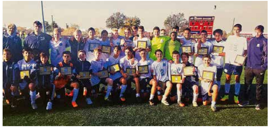
Pictured above: Boys' JV Soccer Team.