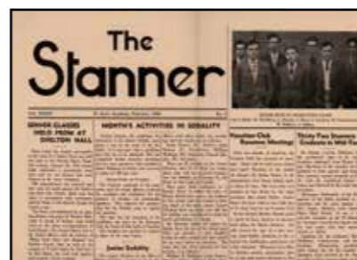
1948 edition of The Stanner

One thing is for sure, The Stanner, however it might look, will continue to tell the stories of Molloy for years to come.